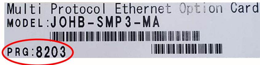
Fig. 2 Example of firmware version 8203 on the option card packaging

The protocol firmware can be found on the label placed on the ethernet ports of the option card, or on the option card packaging (PRG).